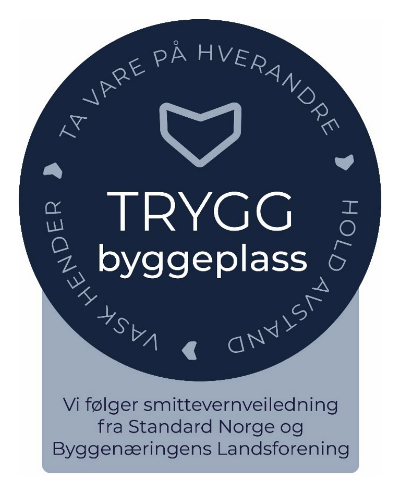
Figure 2 – Safe building site

Enterprises that undertake to follow the rules and implement the measures set out in this document may use the emblem shown in Figure 2.